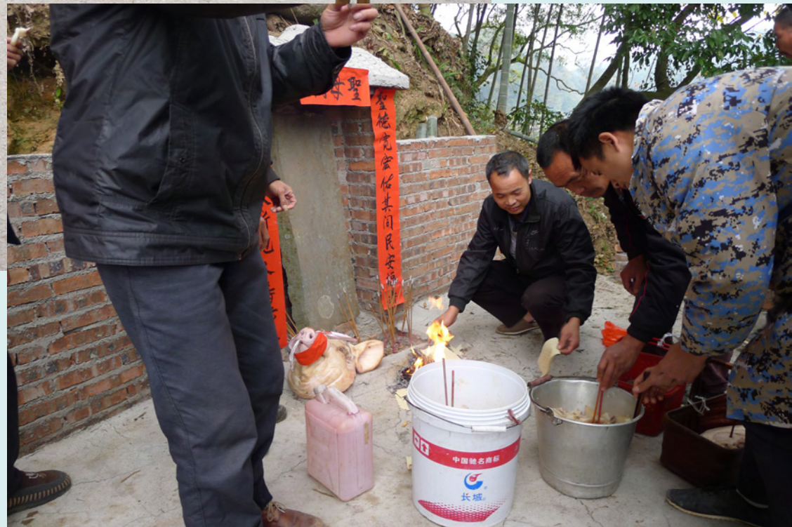
The ancestor-worship ceremony as well the Street Dong song singing competition were very culturally worthy & interesting... 祭祖儀式