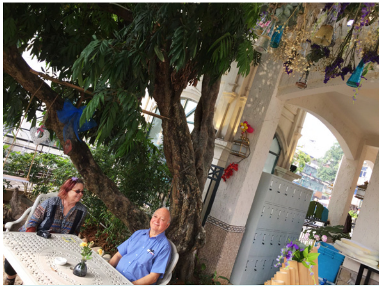
We are having nice Vietnamese coffee with border river-views...