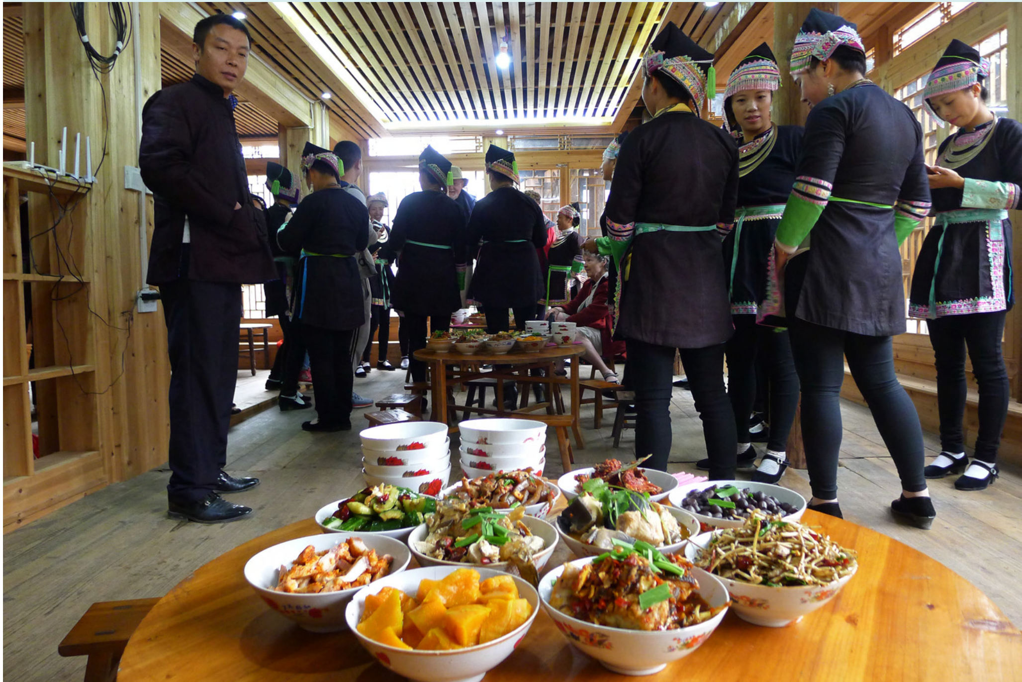
Standing left is the village chief and our host of the lunch... 😊