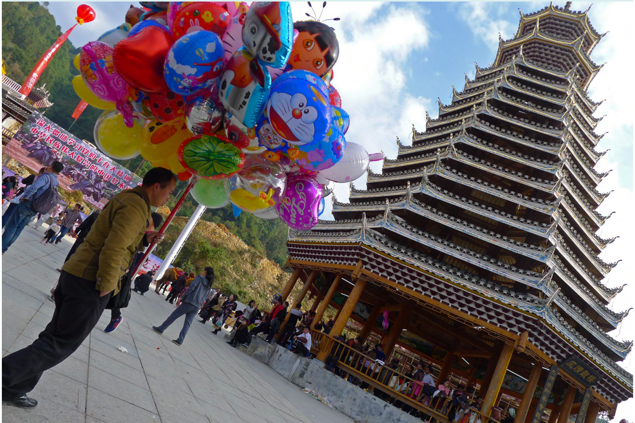
Dong people are known for their Dong-pavilions...