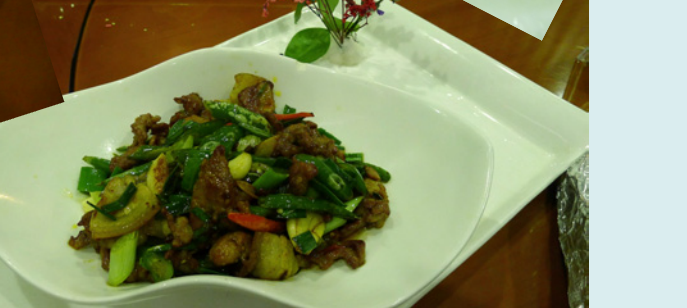
Our meal is still no shabby...