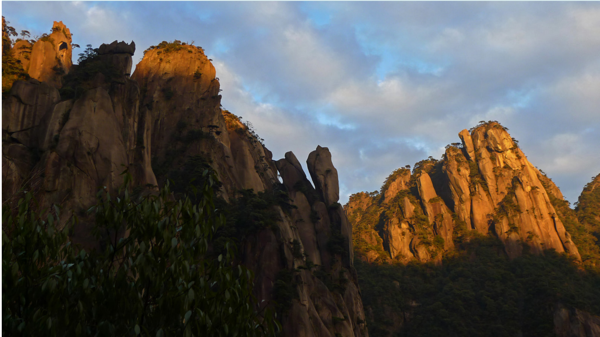
Fascinatingly up on Mt. SanQing 三清山...