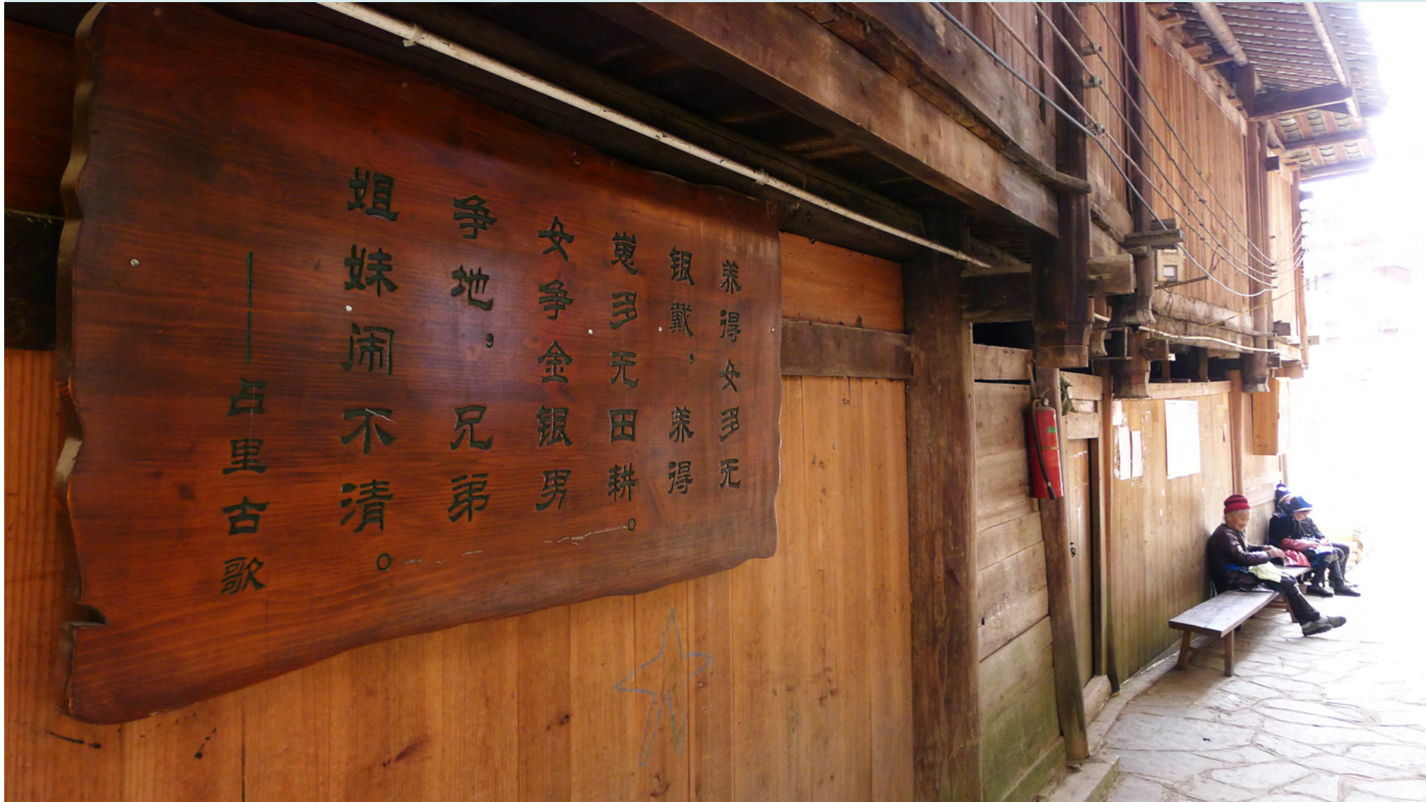
占里古村 Zhanli village - For those who can read the words on this plaque, who would find the wisdoms of the villagers philosophical... and for centuries life in this village keeps excellently balanced...