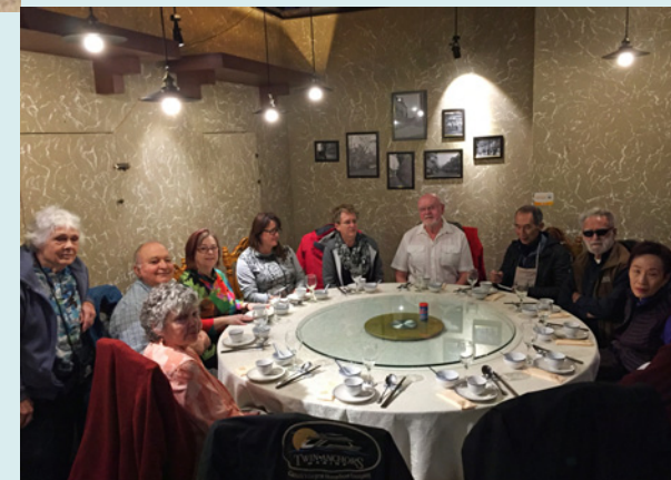
Welcome dinner – Shanghai style...