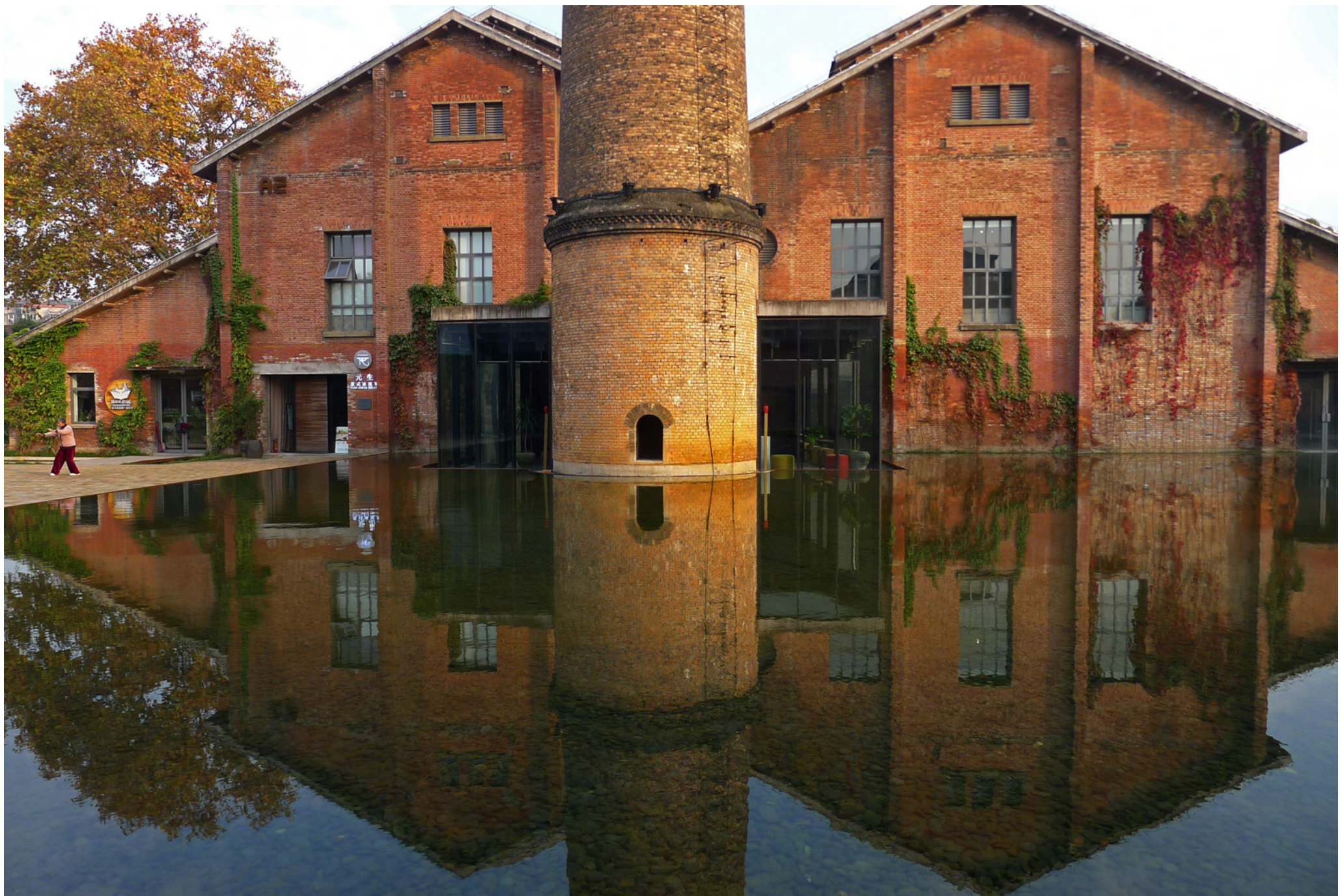
In the light of early morning sun, a woman was playing Taiji by this old factory structure...