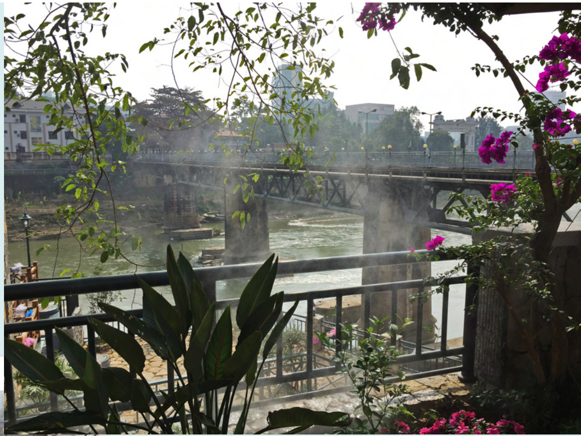
The railroad bridge connect China & Vietnam here...