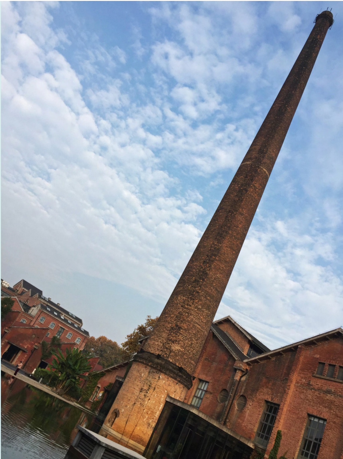
Old porcelain/pottery factories around...