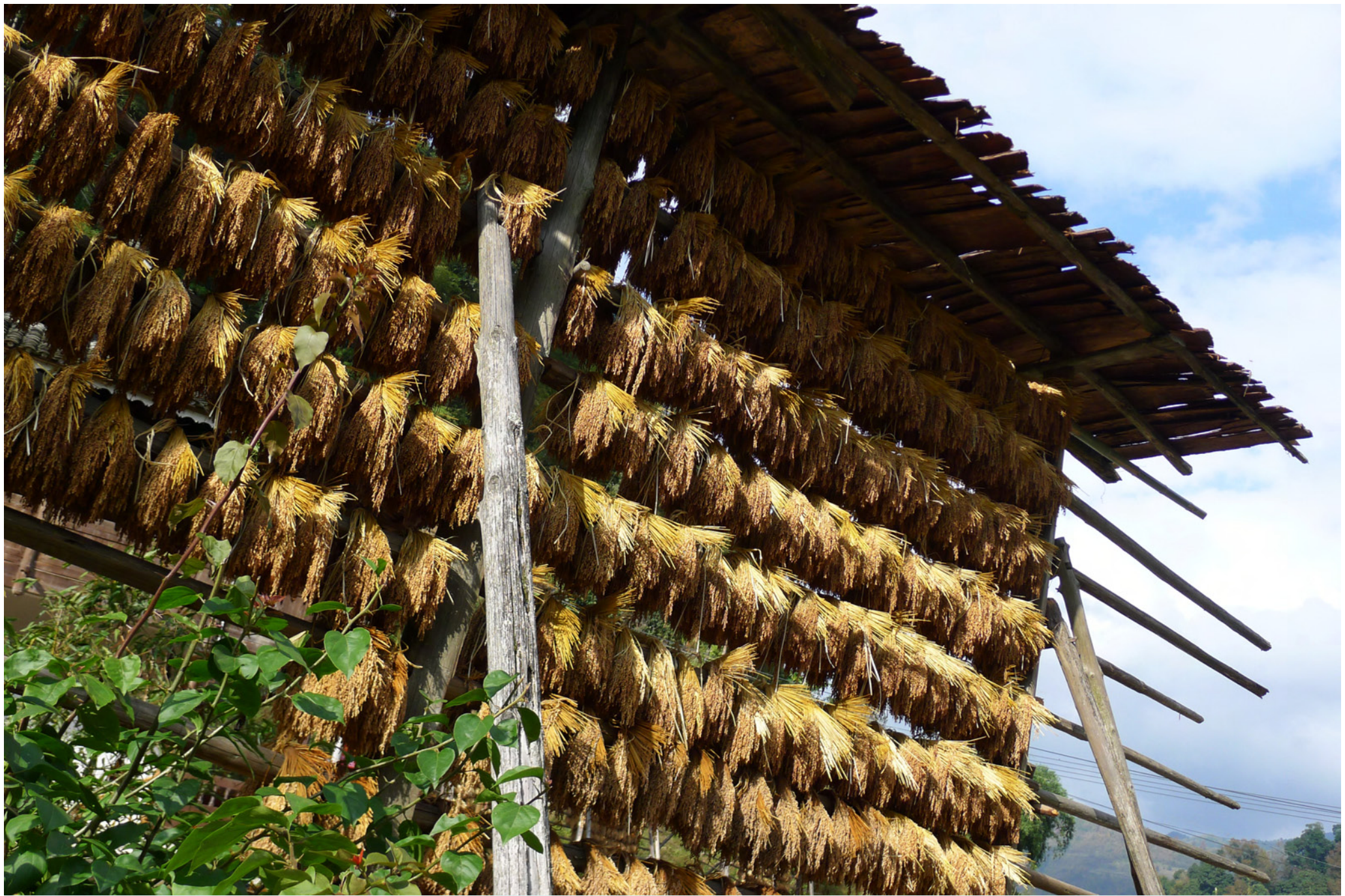
Rice drying rack...