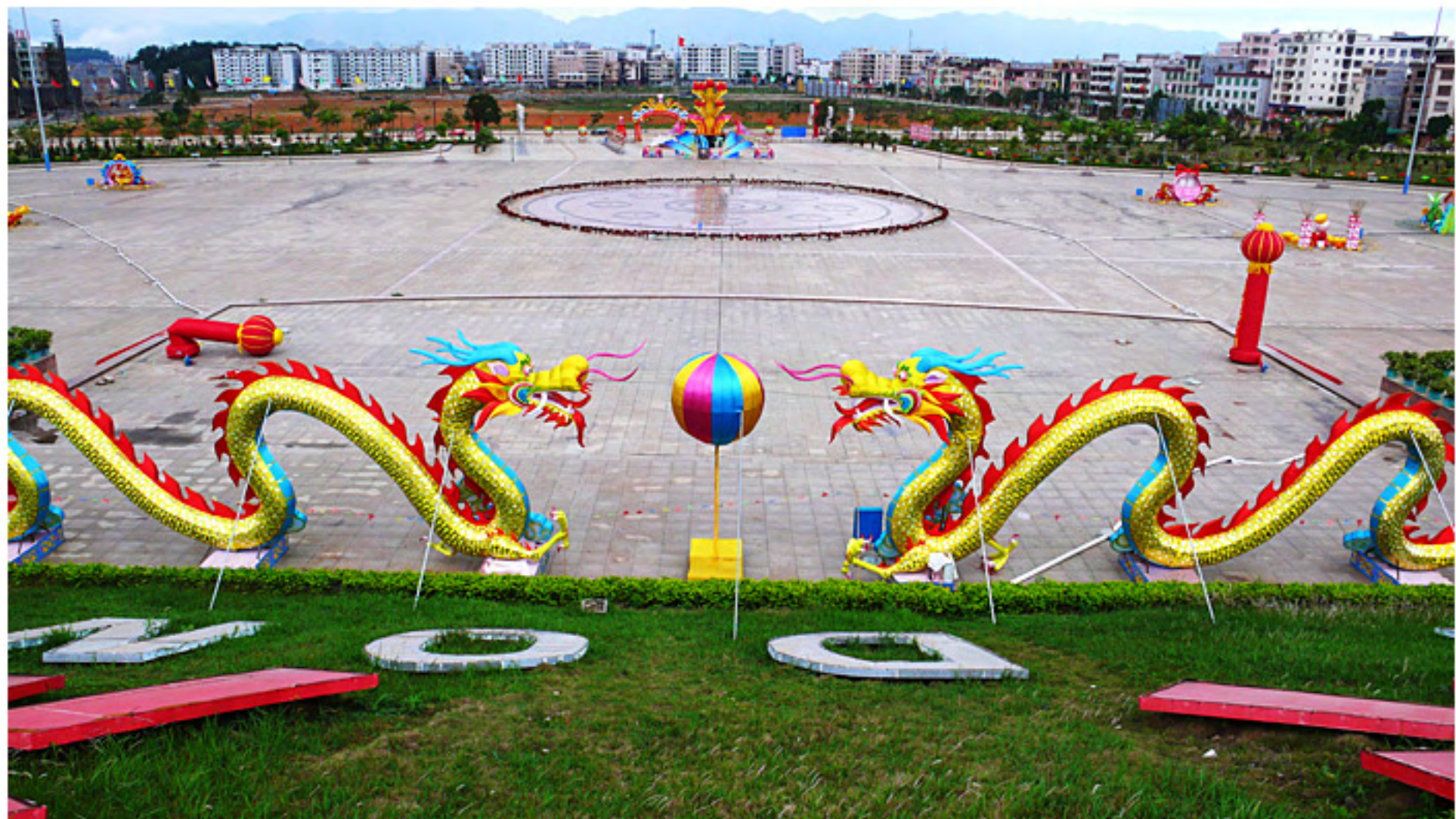
广东阳春县城 Town of YangChun County, GuangDong