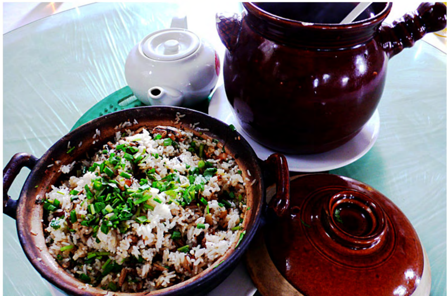
开平黄鳝煲仔饭 KaiPing clay-pot rice delicacy