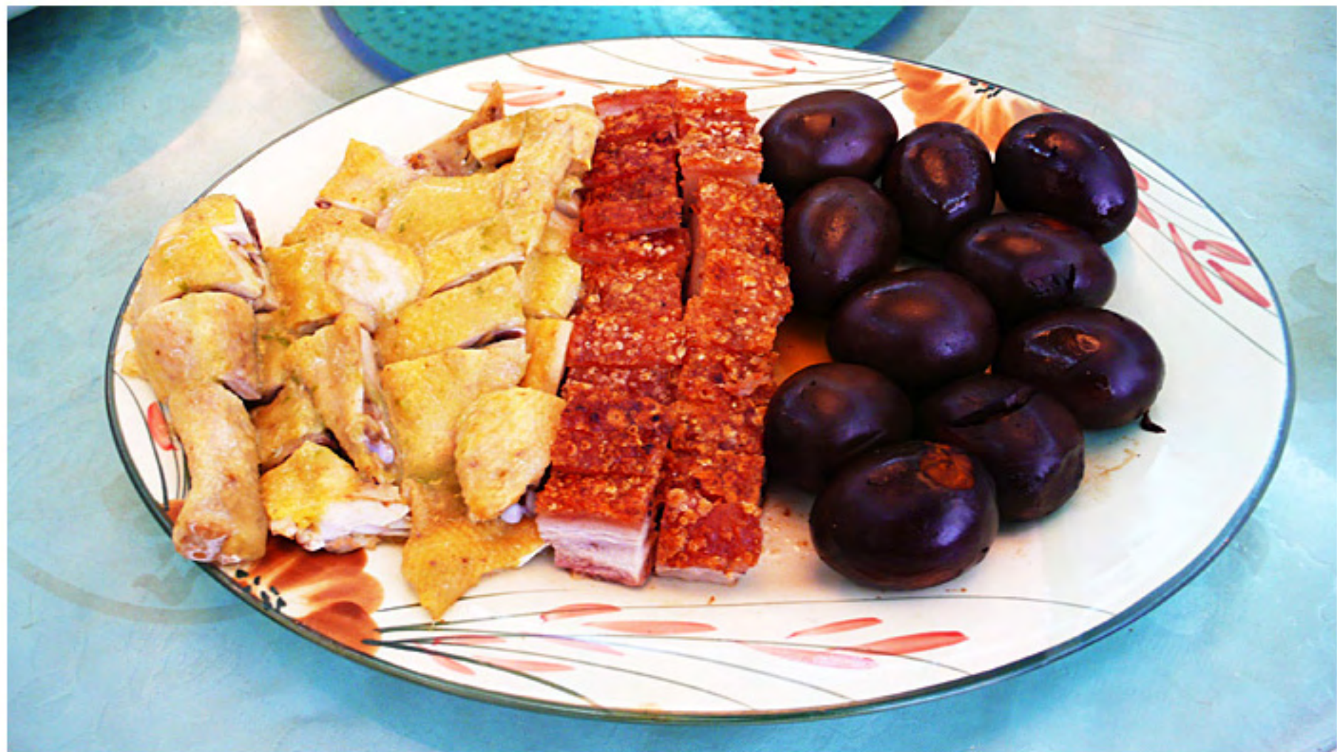
新会司前温蛋 A XinHui SiQian taste of delicacy