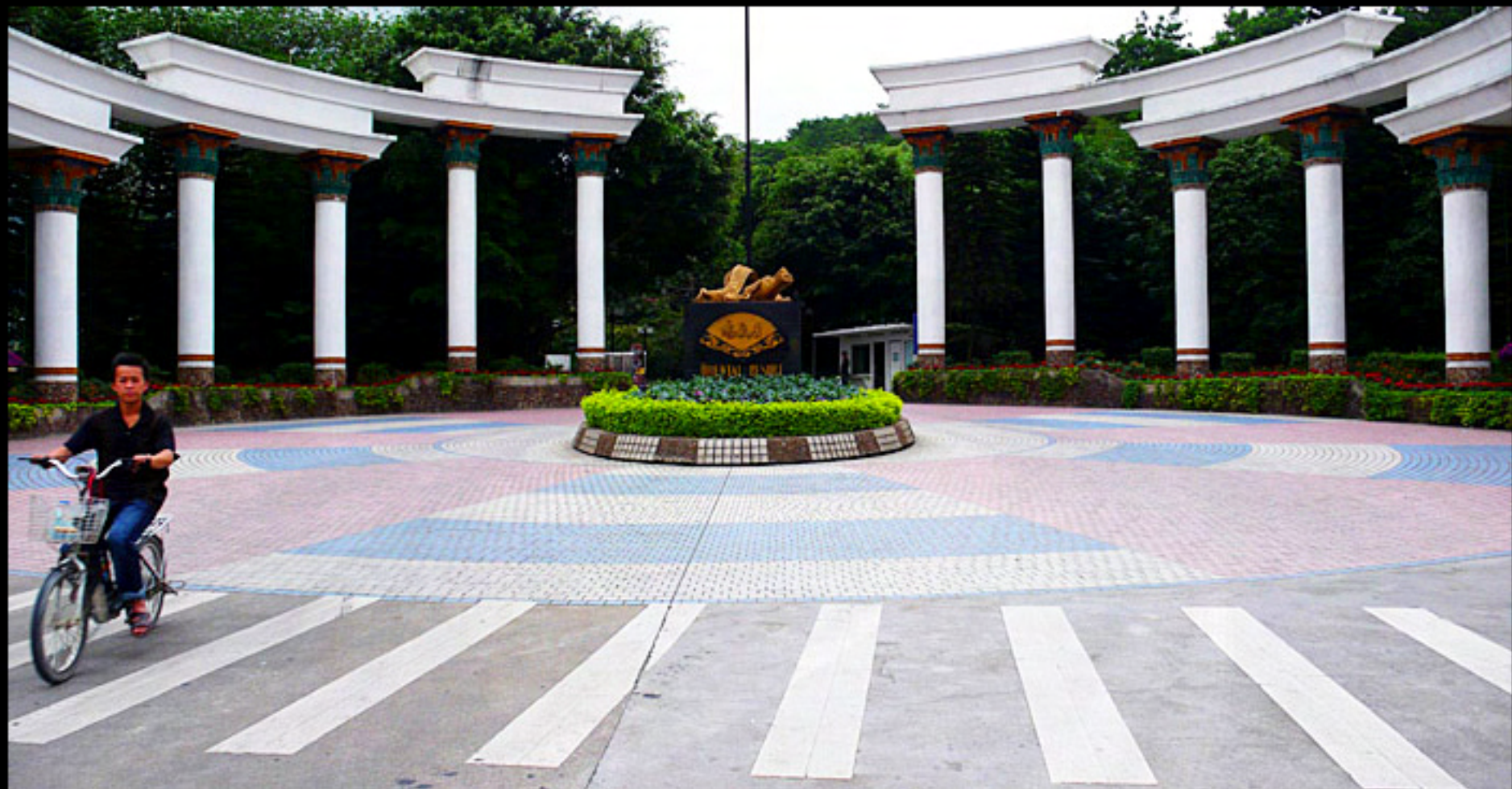
A homage to a family ancestor's grave site just outside Guangzhou City 就清明时节，到大金钟拜谒外公祖坟