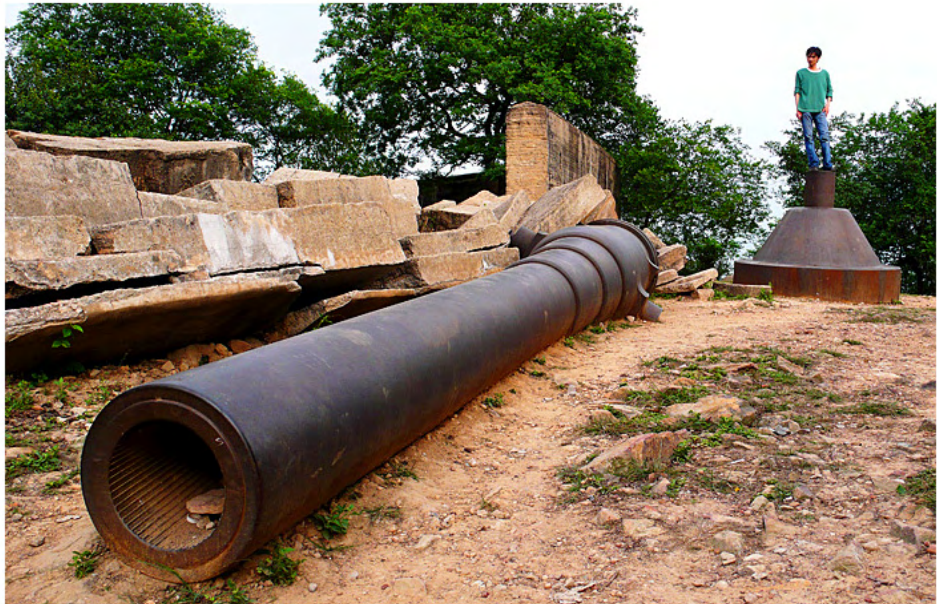
虎门炮台遗址 Hu-Men Fortress Ruin