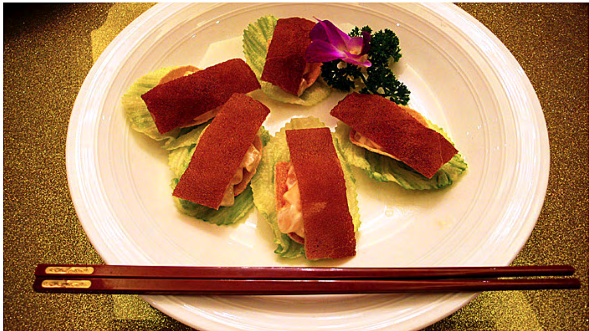
脆皮乳豬沙律 The taste of delicacy