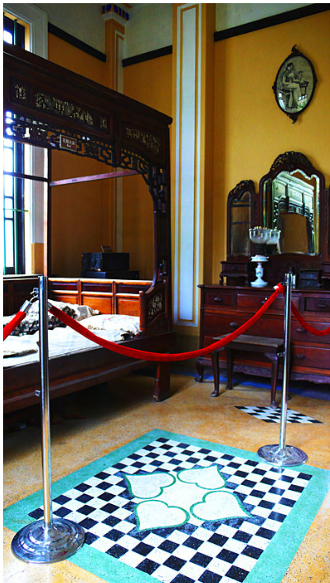
开平立园 LiYuan of KaiPing