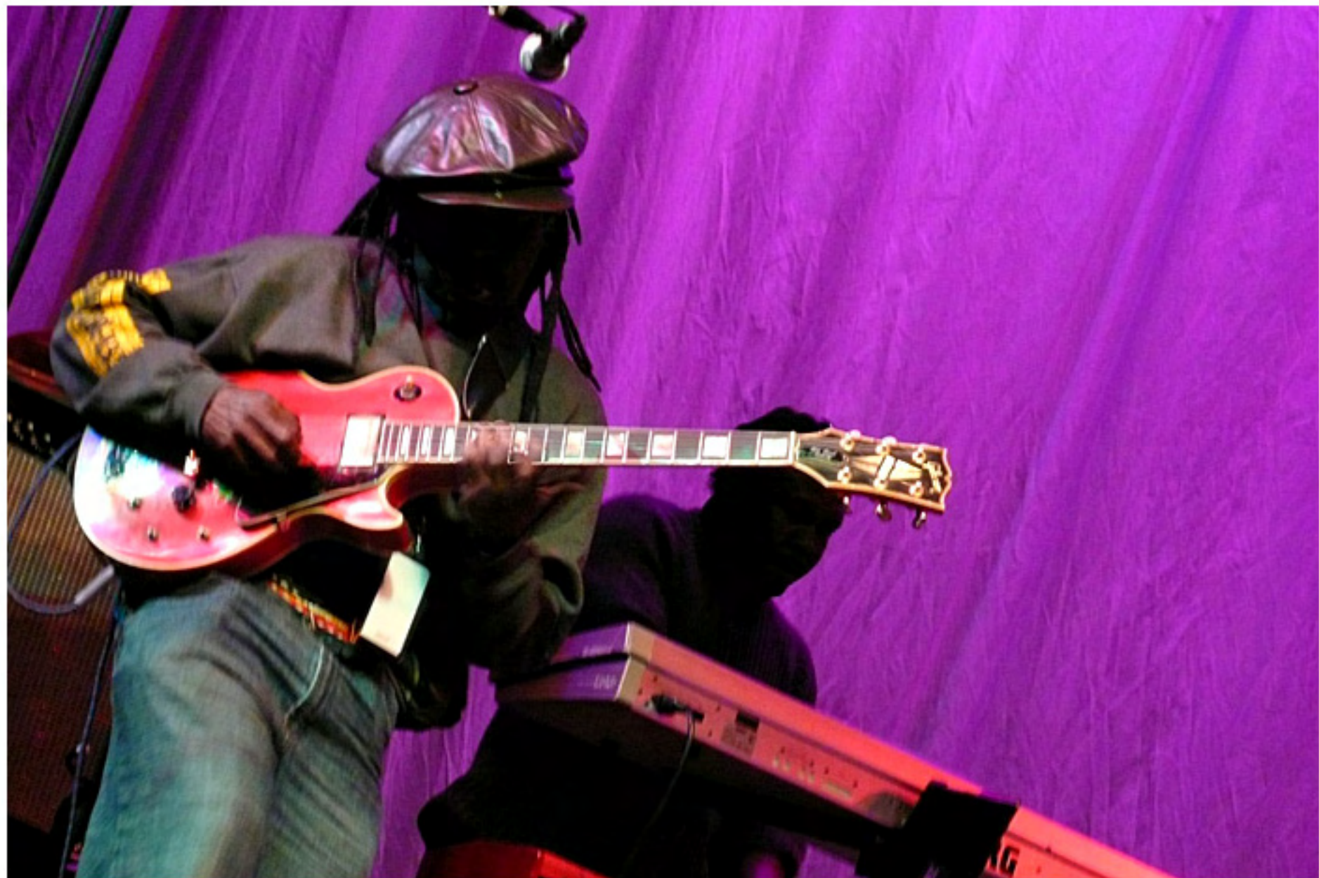
A concert night in Chicago 芝加哥音乐会一夜