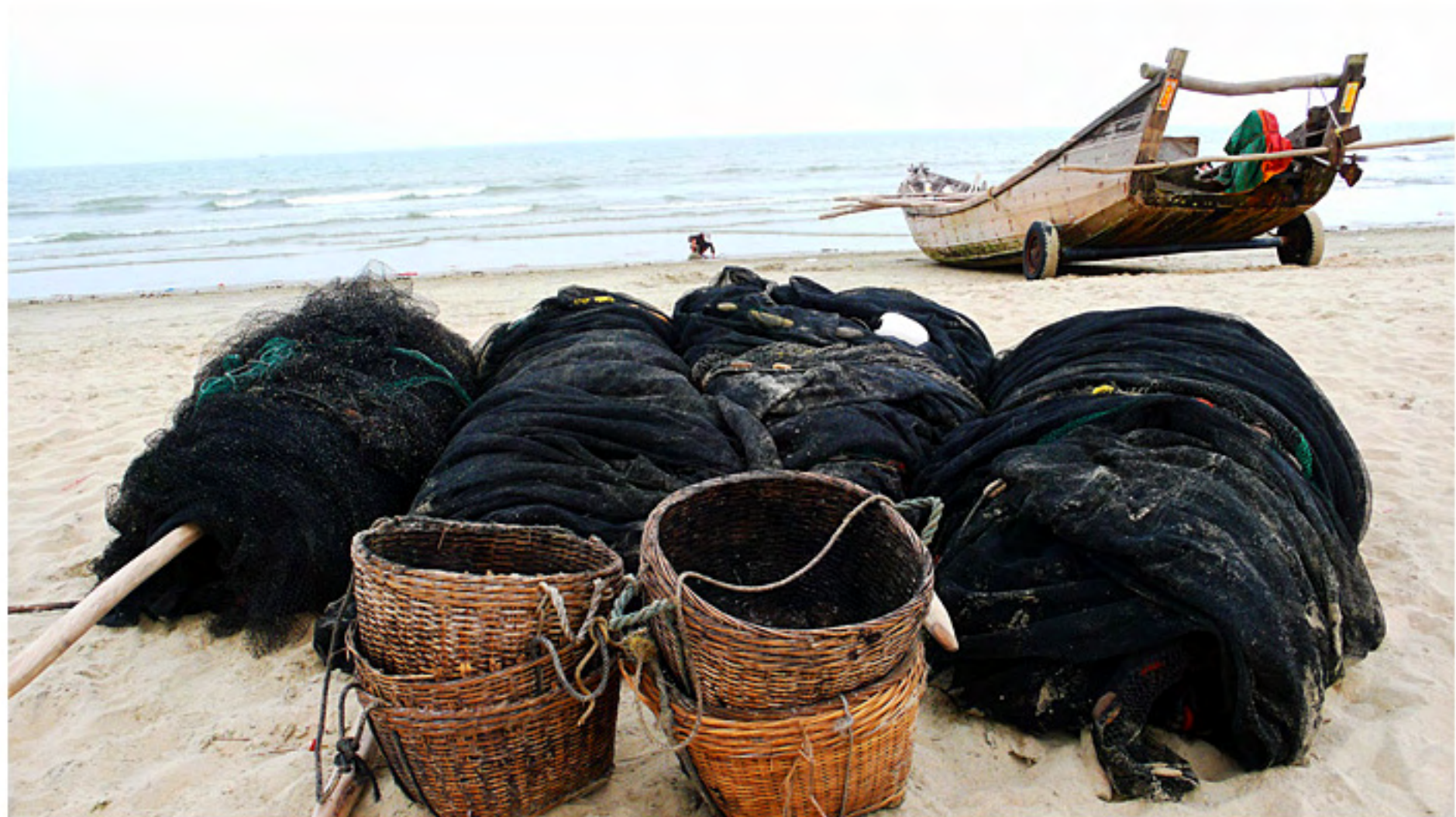
广东电白海岸沙滩 Beach of Dianbai County in Guangdong