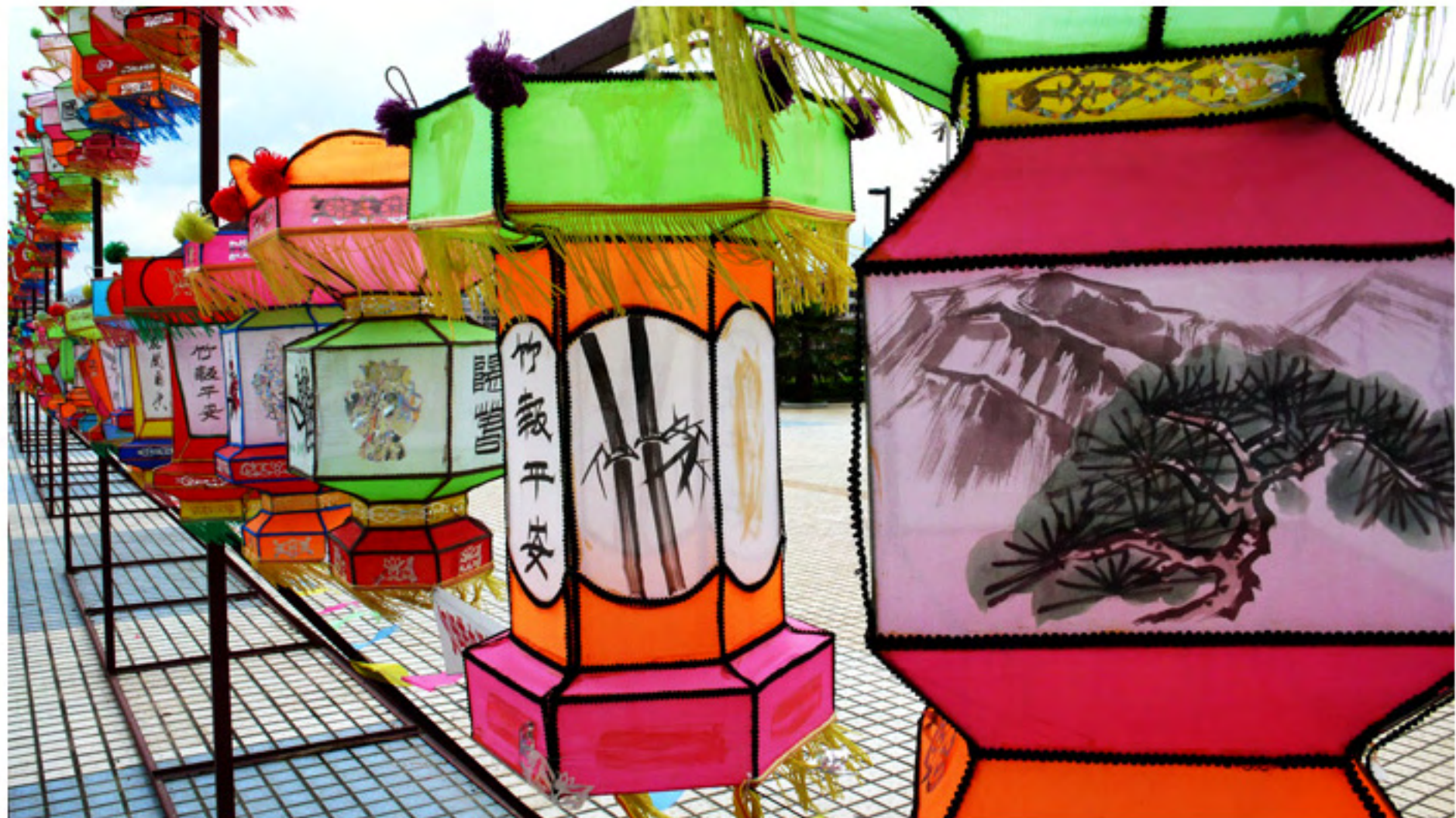
广东阳春县城小景 in YangChun of GuangDong