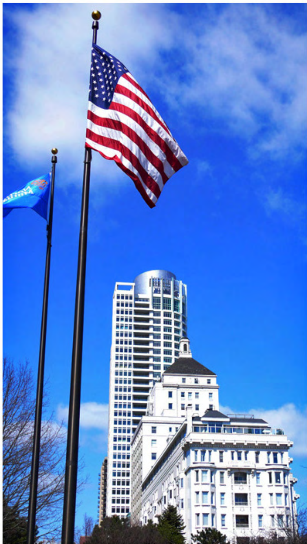
A day in Milwaukee