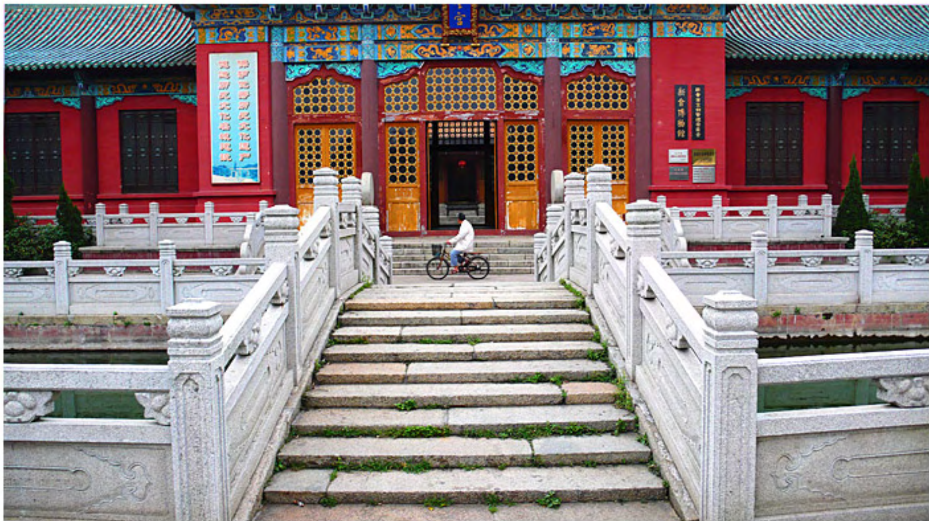
广东新会县会城孔庙, Temple of Confucius in Xinhui County, Guangdong