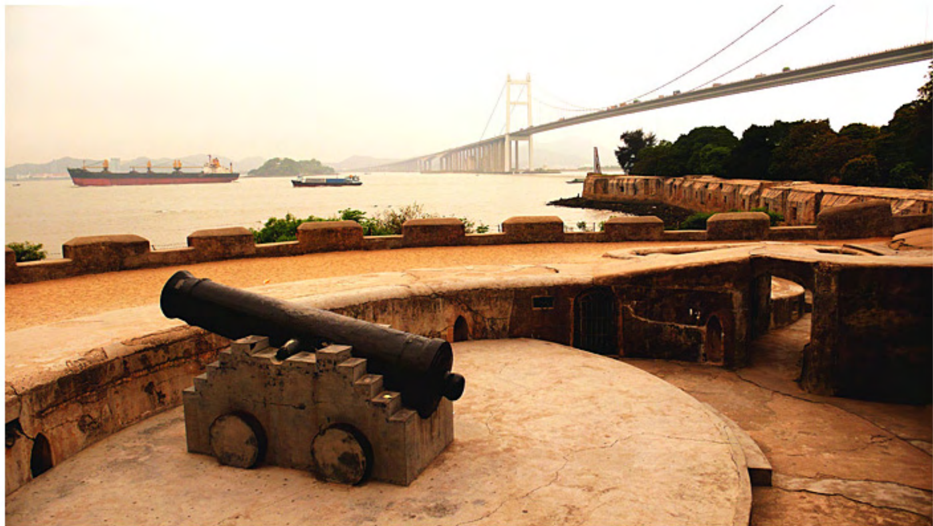
威远炮台 - 广东虎门, Hu-Men, GuangDong