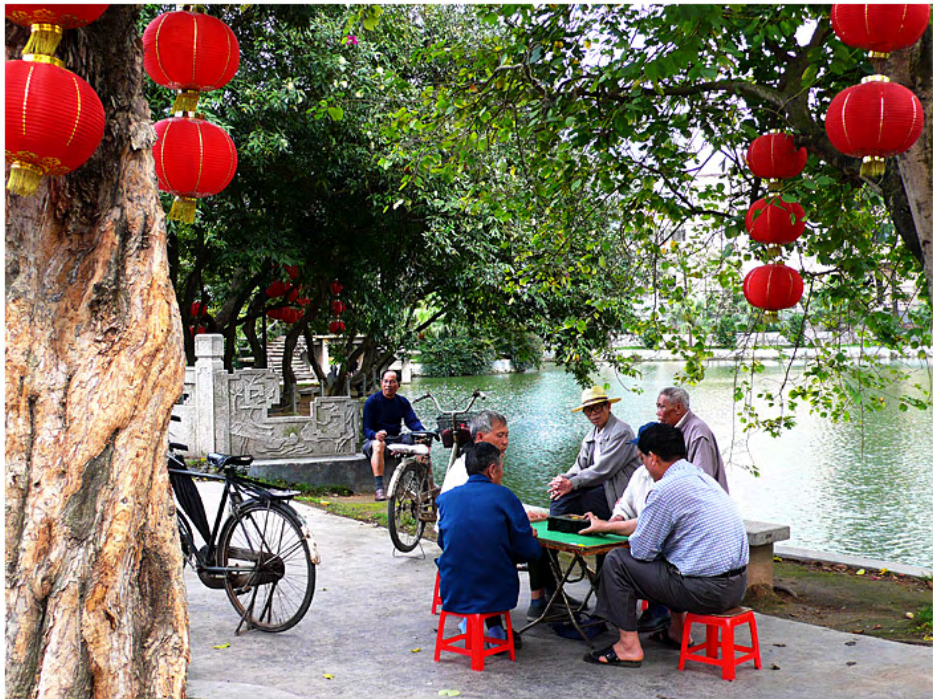
闲情 - 阳春县城 Relaxing in YangChun