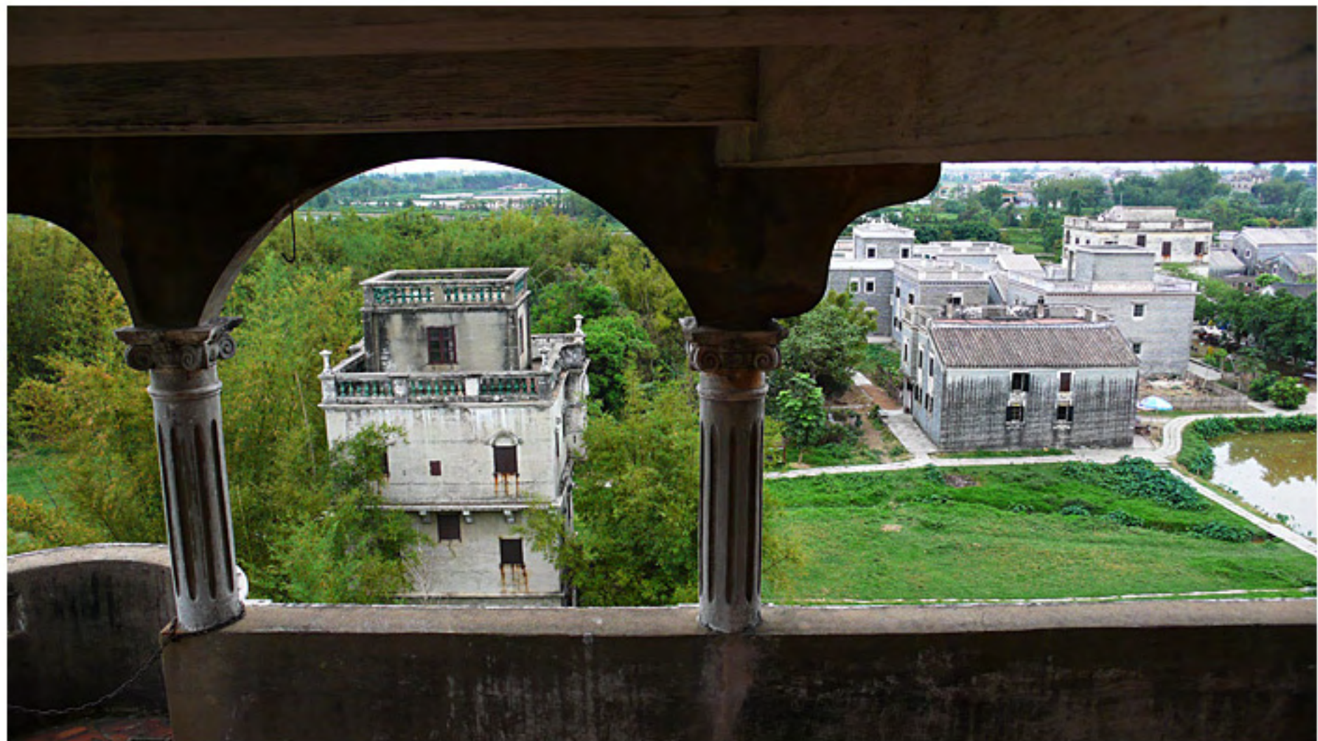
广东开平碉楼建筑 Diaolou Architectures in KaiPing of Guangdong