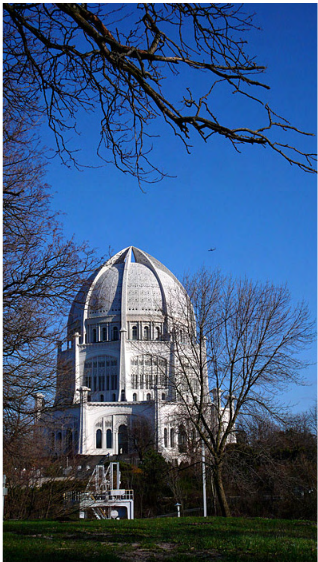
Baha'i Temple, Chicago